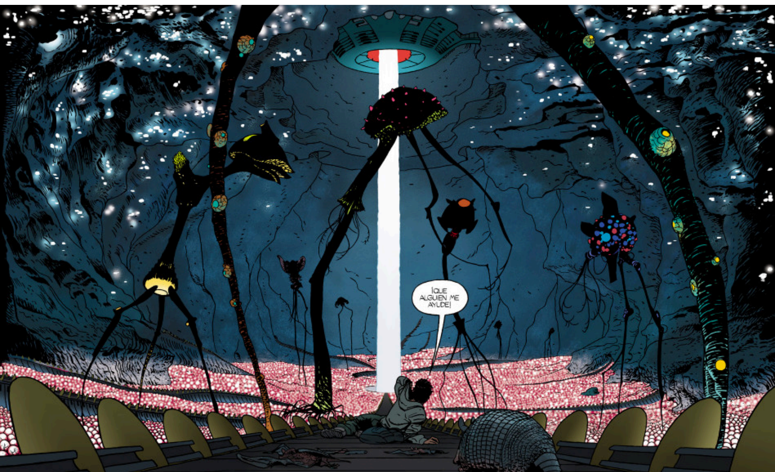
Figure 1 Barrier (collected edition, 2017), chapter 2, p. 68.

metaphor: once they meet at the very border, its protagonists are abducted and kept in an alien spaceship where they find themselves at the mercy of apparently inhumane beings. As I could stress in a previous text (Marini 2019), the alien metaphor serves the parallel drawn between illegal immigrants and threatening, invasive extraterrestrial beings. A few other comic series exploit the extraterrestrial abduction trope and alien metaphor to tackle questions related to immigration, such as Saucer Country (Vertigo, 2012-13); Barrier , though, articulates the abduction space in a rather meaningful manner.