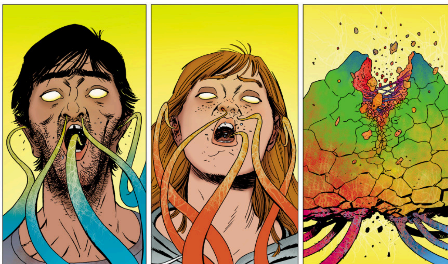
Figure 3 Barrier (collected edition, 2017), chapter 5, p. 174.

utterance the reader encounters is bilingual. Speaking with his boss in English and yet expressing his fear in Spanish, the verbal manifestation of Liddy’s Mexican farm-worker clarifies that, often, emotions are conveyed in one’s own maternal language—no matter the assimilation process one’s been put through. Liddy herself will only speak English, as Oscar will speak Spanish throughout the five chapters; with a brilliant expedient, the authors have the aliens speak a color language, their balloons filled with bright shades—the reader can assume—according to the message and feeling they are expressing.